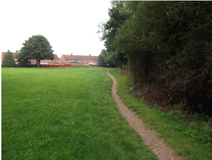
Photo 2: the existing right of way (footpath 508) crosses the southern end of Ramsdale Avenue open space. This would be widened to 3.0m and a stone surface added to ensure it was able to be used in all weathers.