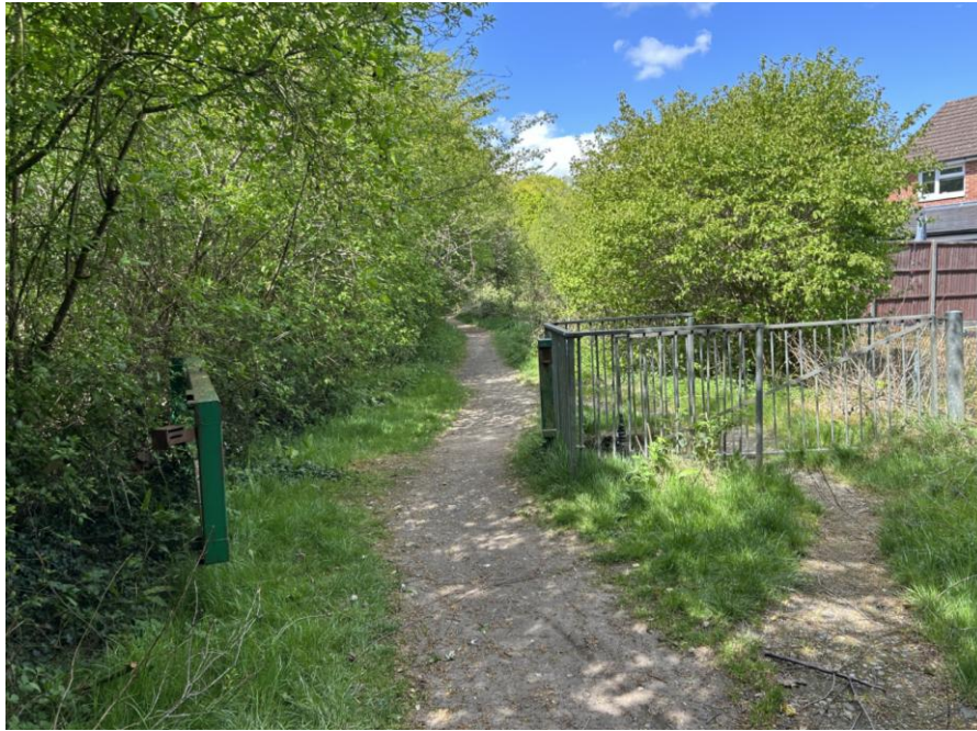
Photo 4: this gate to the rear of properties in Ramsdale Avenue would be removed and replaced with an alternative feature closer to Park House Farm Way. The Hermitage Stream lies to the left, behind the hedgerow, which will remain.