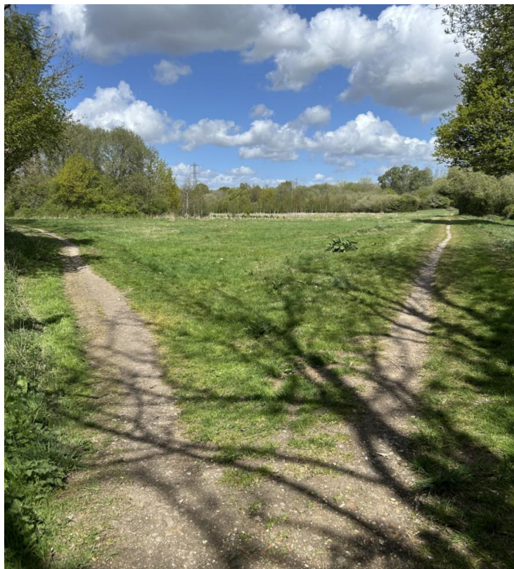
Photo 3: due to land shape, it is likely that a small ephemeral wetland will form in the angle between the existing right of way (footpath 508) to the left and the path along the rear of properties in Ramsdale Avenue (to the right), adding interest and supporting biodiversity. Drainage will be provided to allow water in any pool to escape into the Hermitage Stream.