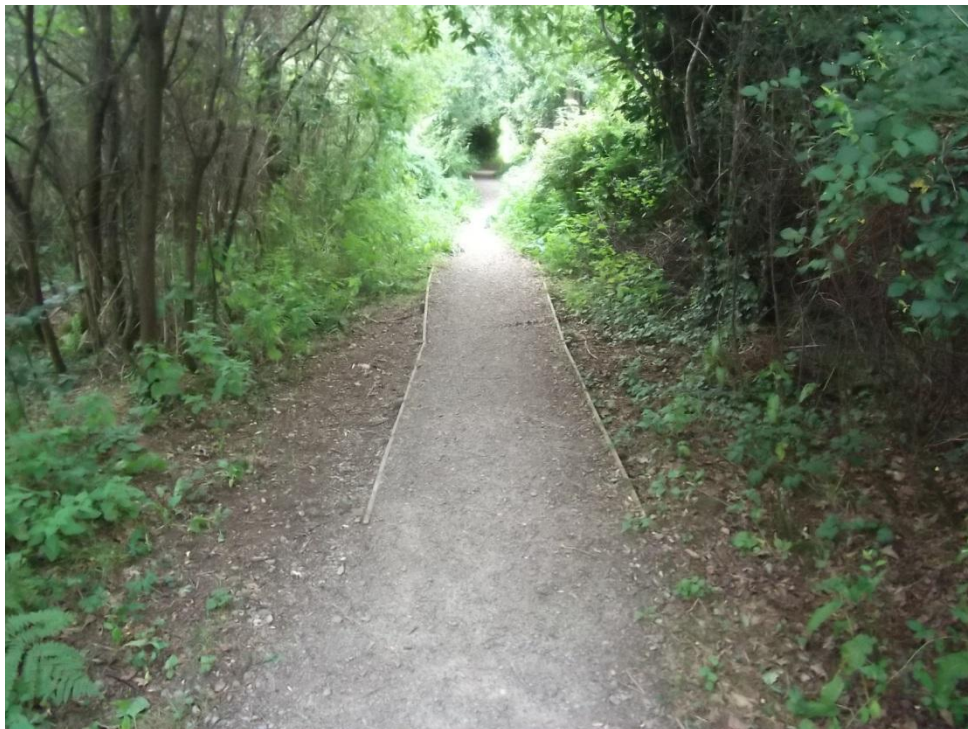
Photo 1: parts of footpath 508 have been repaired but still become very wet in winter. The project proposes to widen this path to 3.0m with clearance of the adjacent understorey to open the vista and create an attractive route for users.

Once (and assuming) planning permission is awarded we will start to carry out the mitigation work quickly afterwards so that this has a chance to be established during the summer and autumn. After the bird nesting season ends in September, we will then carry out site clearance, ready for the main build to follow. We plan to have the path open for use by the end of winter 2026/27.