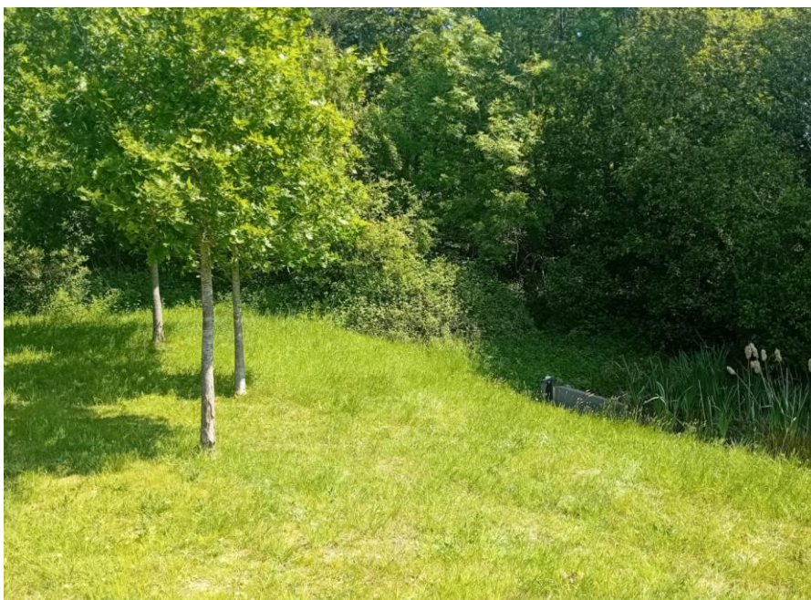
Photo 5: the path will emerge onto Fitzwygram Way between the recently planted trees and the swale (the headwall of which is just visible). The trees in the background are self seeded and will be replaced as part of the mitigation package.