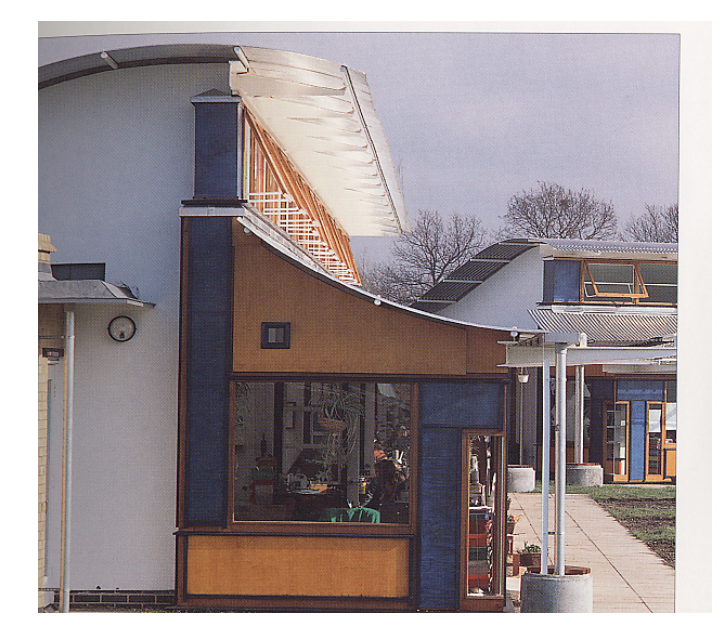
Farnborough Grange junior school, Hampshire

PSD methods can also be applied in non-domestic buildings to similar effect, although in some building-types such as offices the emphasis changes from heat gain and towards the achievement of appropriate daylighting and effective natural ventilation. PSD methods should be considered, with other design objectives, in all new developments in Havant.