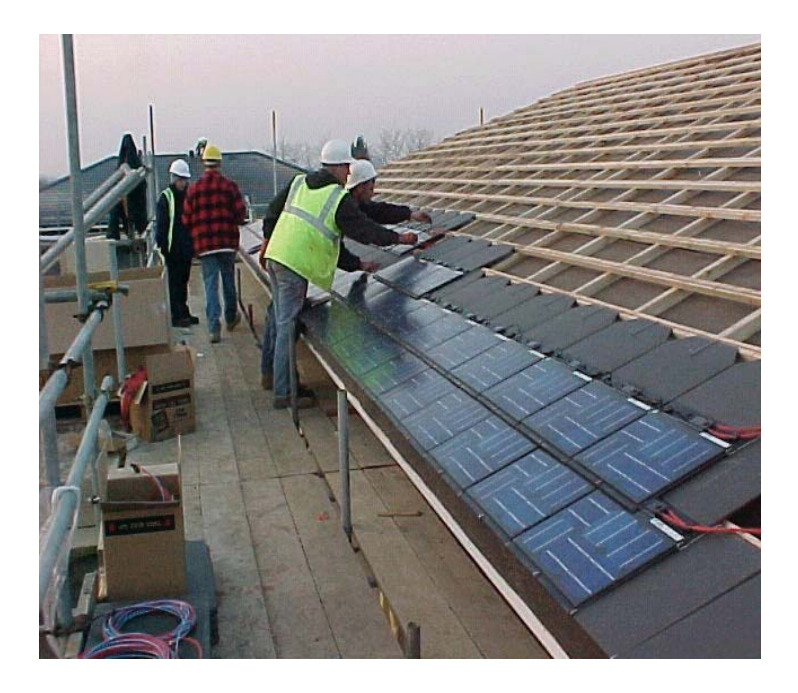
Installation of solar photovoltaic sunslates

These employ solar radiation to stimulate an electrical current in photovoltaic (PV) cells. These cells can be mounted either in panels on the exterior of buildings or, increasingly, are integrated into building materials such as cladding, glass and roof tiles. The high price of PV installations will limit their uptake in the short term. However, the Building Research Establishment anticipates that costs will fall such that a widespread deployment of the technology can be anticipated. New developments, retrofitted systems or wider refurbishment, all represent potential opportunities for deployment of PV. As such, roofs on new developments (domestic, commercial and industrial) should incorporate south-facing slopes in order to facilitate the eventual future use of PV technology.