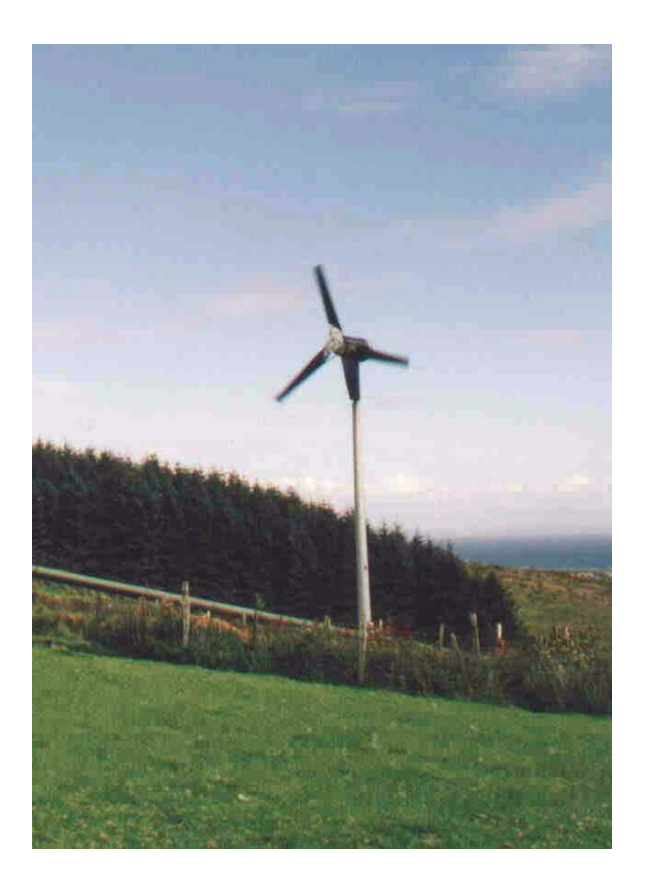
A small-scale free standing wind turbine