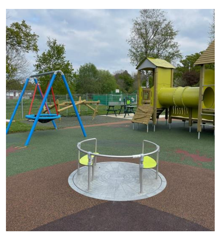
Photo 2.9: Waterlooville Recreation Ground Play Area, also known as Jubilee Park (Summer 22)