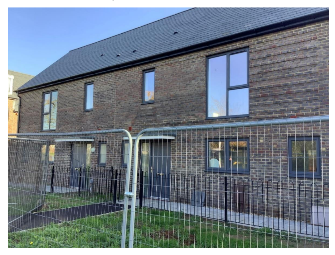
Photo 3.1: Affordable Housing being delivered on site in West Leigh (Autumn 22)