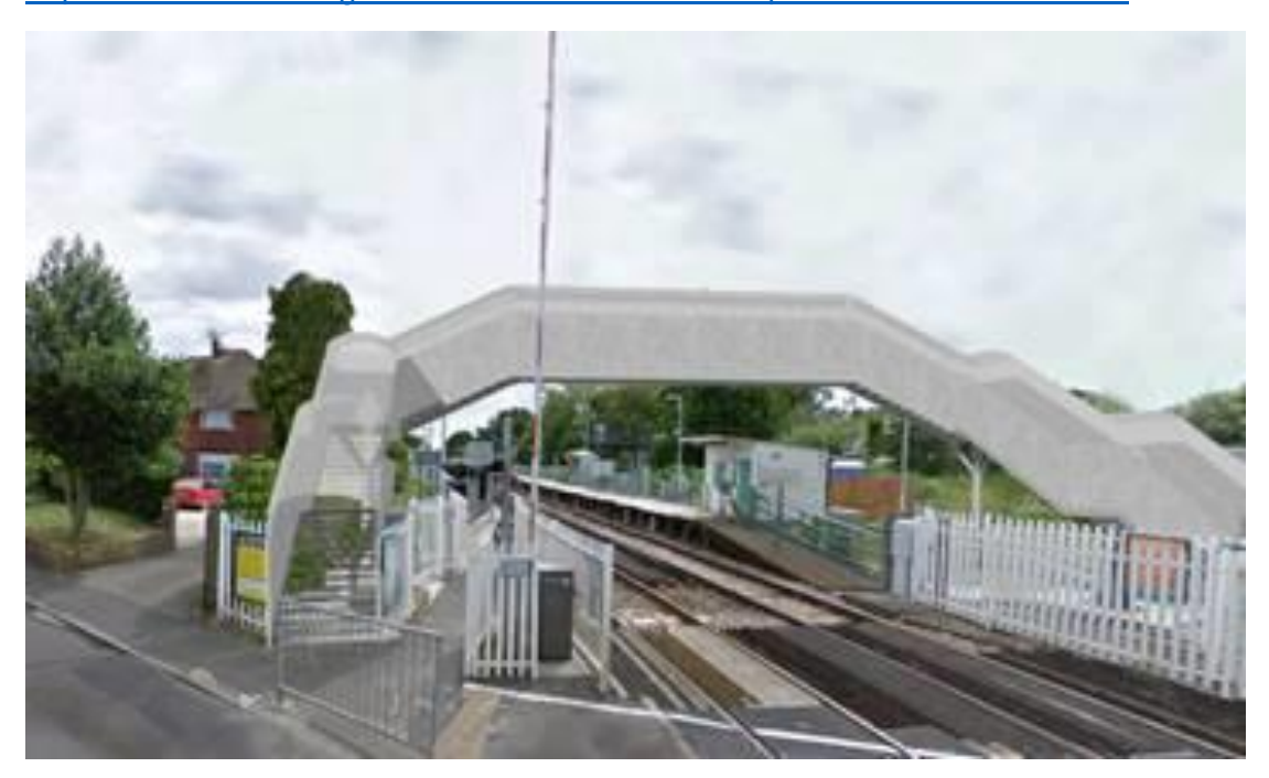
Figure 2.4: Potential crossing solution for Warblington Footbridge – for illustrative purposes only

https://havant.moderngov.co.uk/ieListDocuments.aspx?Cld=128&Mld=11334