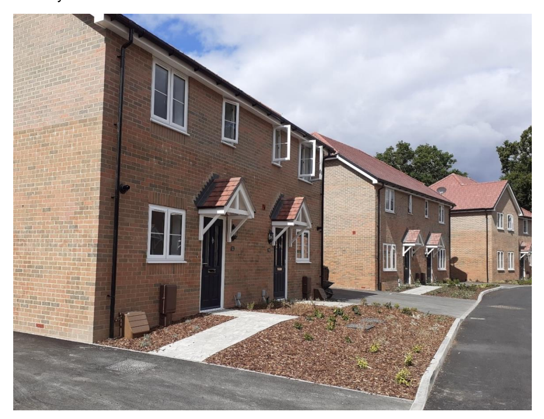
Photo 3.2: Affordable Housing delivered on site in Emsworth (Summer 22)

3.14 The large majority of Affordable Housing is provided by the developer on site at no cost to the Council. The photos below show progress on some current on site affordable housing delivery: