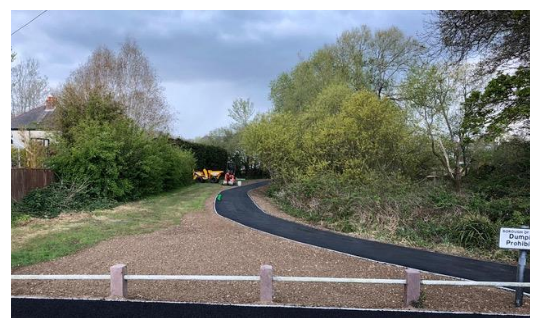
Photo 2.6: Works nearing conclusion on Elstead Gardens to Ladybridge Road Footpath

2.19 As it often takes a long time to implement a capital project, whilst funds have been allocated, most of this funding has yet to be spent. During the reporting year expenditure on Strategic CIL and Neighbourhood Portion Projects totalled £750,265.60. Further detail of exact CIL expenditure at project level is provided in Appendix B, Paragraph g.