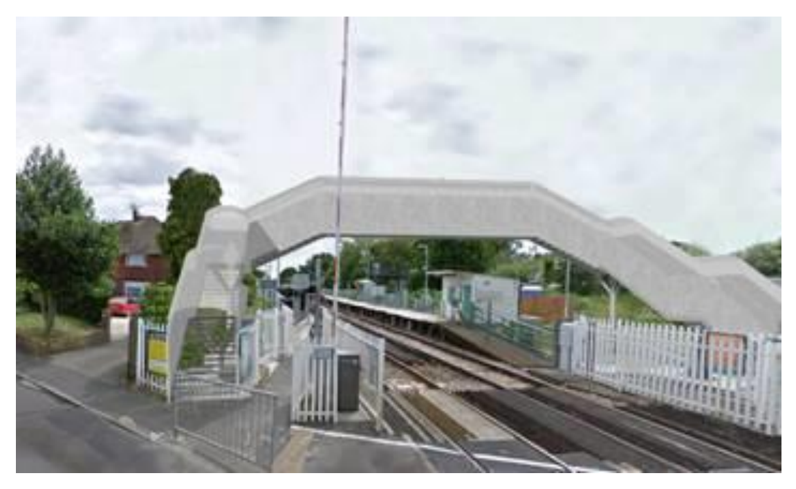
Figure 2.4: Potential crossing solution for Warblington Footbridge – for illustrative purposes only