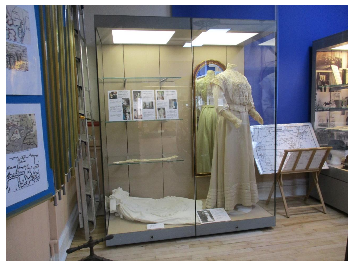
Photo 2.7: New Emsworth Museum Cabinet in Situ (funds granted 26 February 2021)