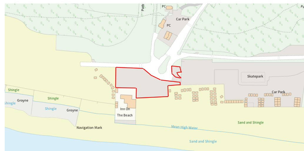
West Beach car park