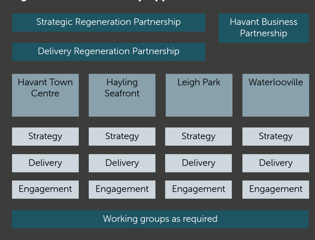
Figure 6: New Partnership Approach

We will develop new partnerships with a range of existing stakeholders, and new ones from arts and culture, education and community organisations, to establish a new partnership and governance model.