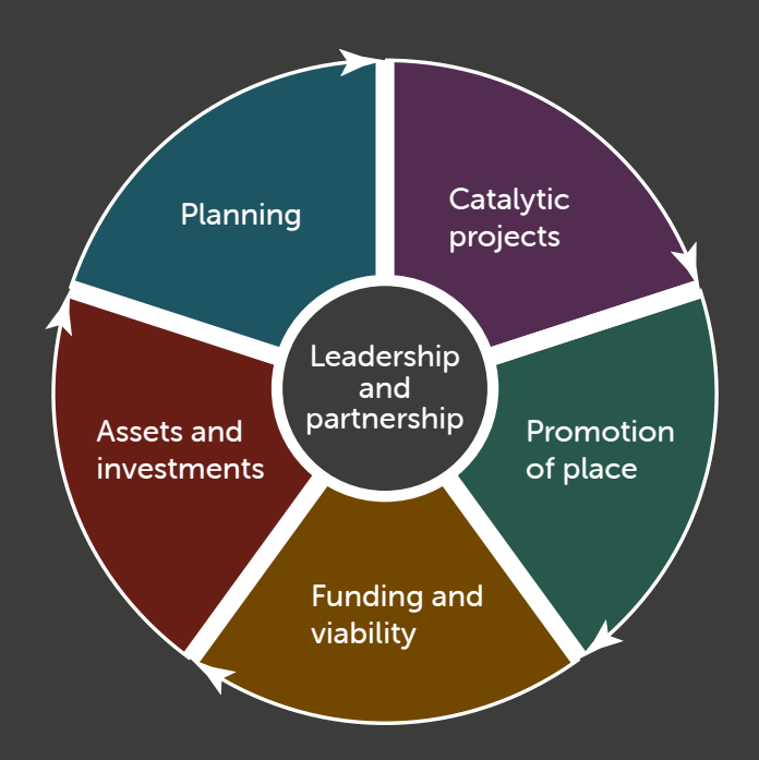
Figure 3 – Council's leadership and partnership role

Consideration will be given to the most effective delivery approach for each project and a blend of approaches will most likely be used