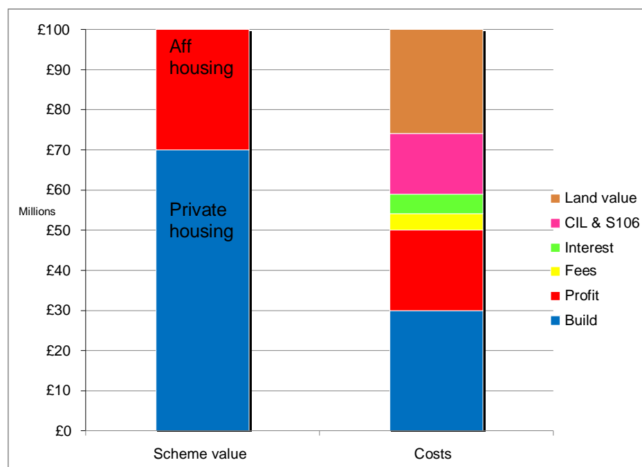
Figure 4: Basic outline of elements required for a viability assessment