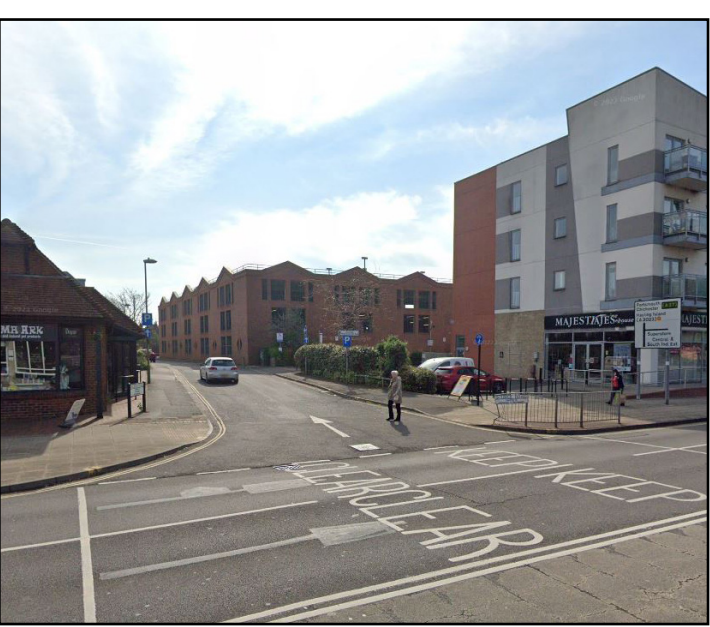
VIEW FROM PARK ROAD SOUTH ALONG THE NORTHERN EDGE OF BULBECK ROAD