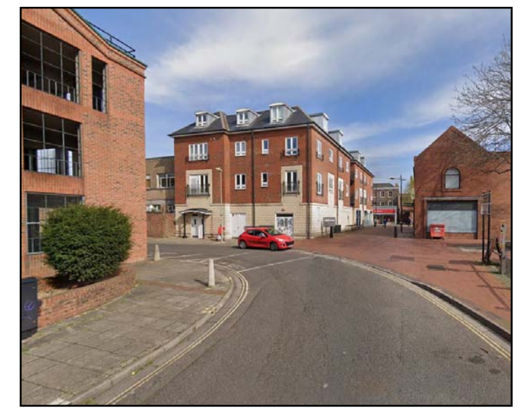
EASTERN EDGE OF BULBECK ROAD, LOOKING TOWARDS WEST STREET

The funding we have requested through this bid to the Brownfield Release fund will enable the demolition of the existing car park, creating a vacant site, which can then be brought forward as a development opportunity, demonstrating our commitment to delivering the wider town centre ambition.