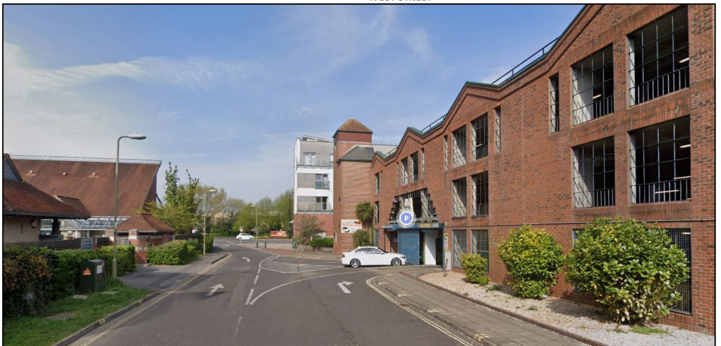
SOUTHERN EDGE OF BULBECK ROAD, LOOKING TOWARDS PARK ROAD SOUTH, WITH THE EXISTING ACCESS POINT INTO THE CAR PARK