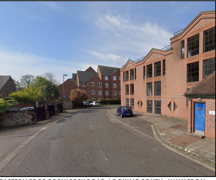
EASTERN EDGE OF BULBECK ROAD, LOOKING SOUTH, AWAY FROM WEST STREET